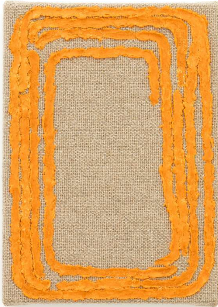
JD Reforma Intramuros 4 , 2021 papaya soap, belgian linen, Gamvar 36 x 16 cm 14 5/32 x 6 1/4 inches