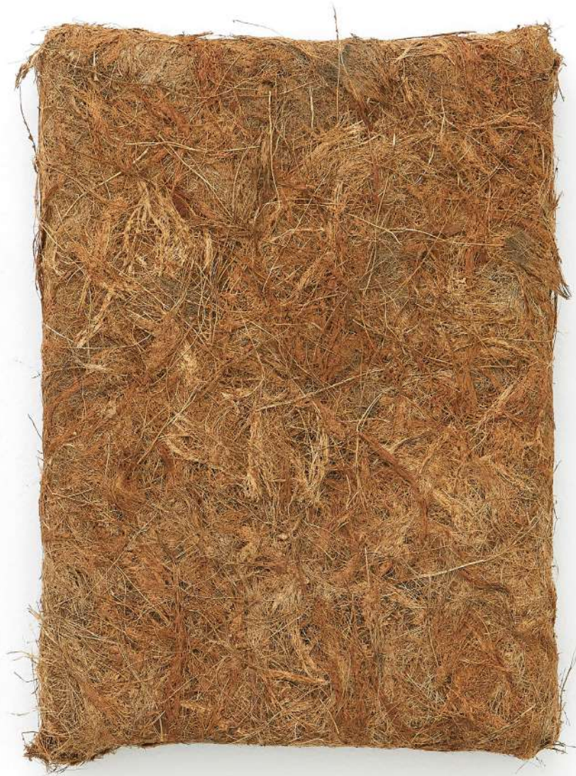
JD Reforma Husk 1 , 2021 coconut husk, acrylic binder 38 x 27 cm 14 15/16 x 10 5/8 inches