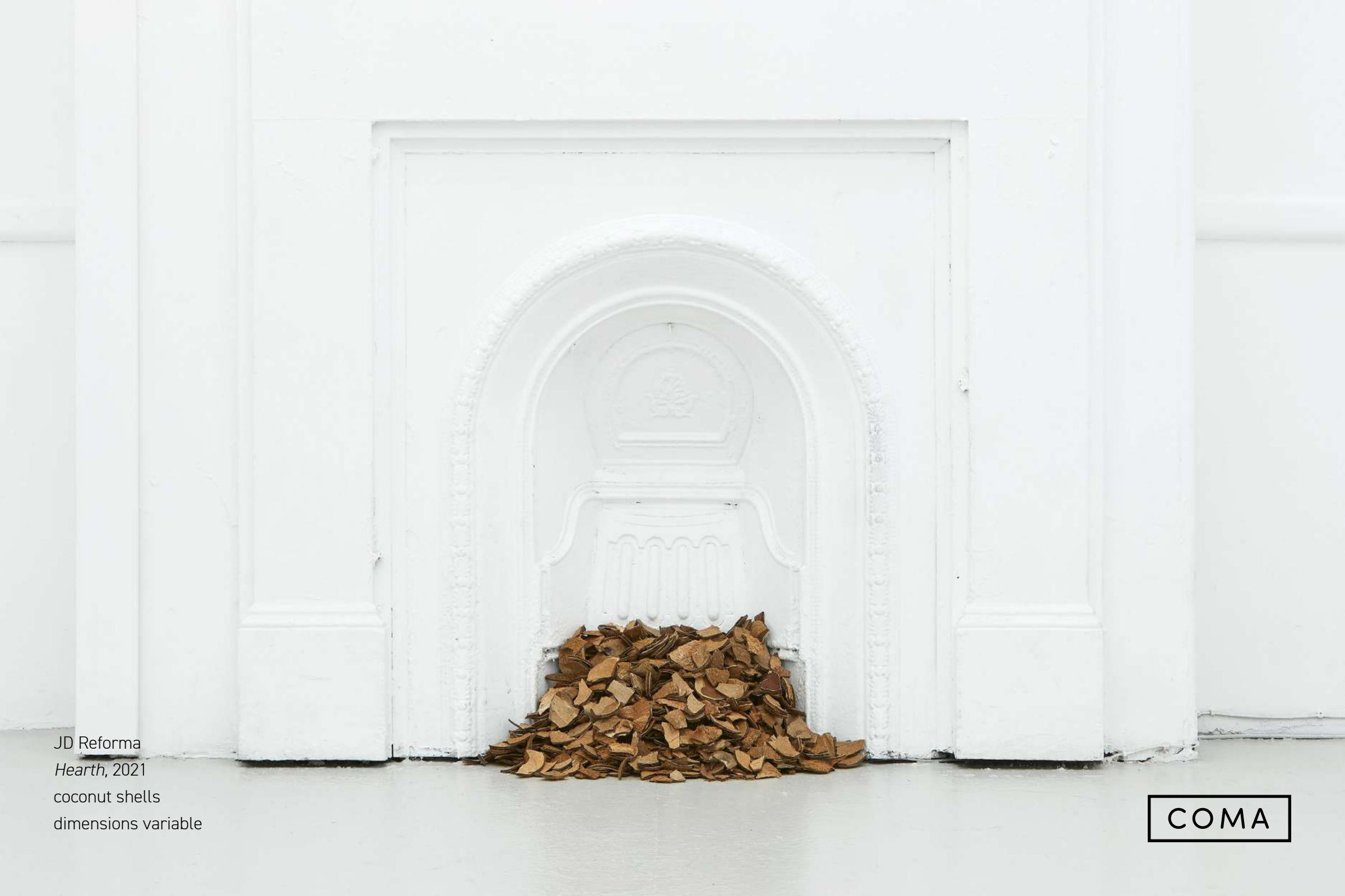
JD Reforma Hearth , 2021 coconut shells dimensions variable