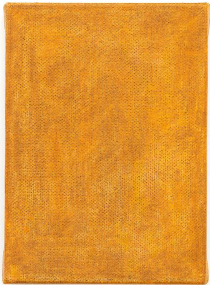
JD Reforma Intramuros 1 , 2021 papaya soap, belgian linen, Gamvar 36 x 16 cm 14 5/32 x 6 1/4 inches