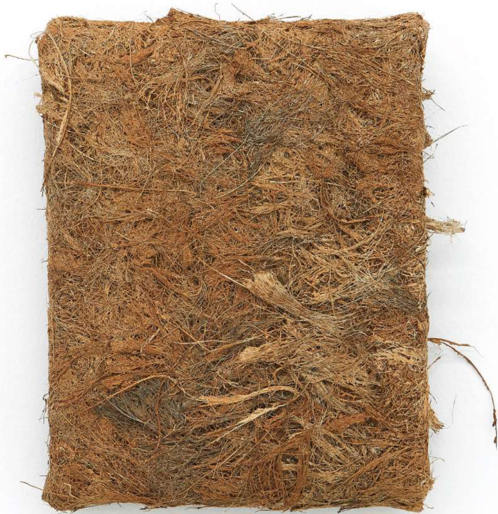
JD Reforma Husk 4 , 2021 coconut husk, acrylic binder 28 x 22 cm 11 1/32 x 8 21/32 inches