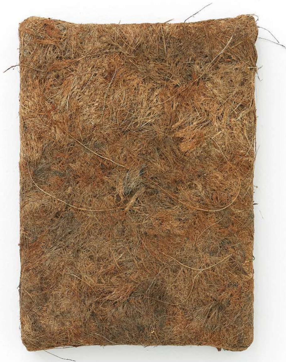
JD Reforma Husk 2 , 2021 coconut husk, acrylic binder 38 x 27 cm 14 15/16 x 10 5/8 inches