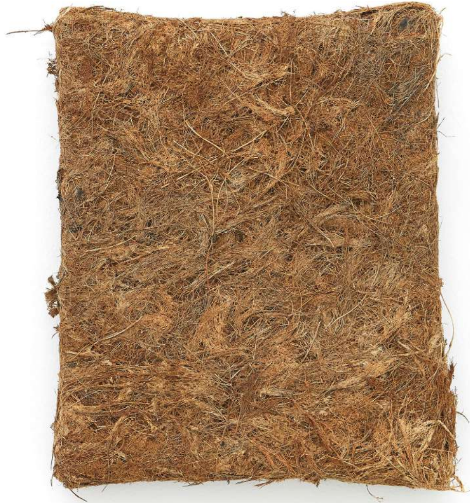
JD Reforma Husk 3 , 2021 coconut husk, acrylic binder 33 x 27 cm 12 31/32 x 10 5/8 inches